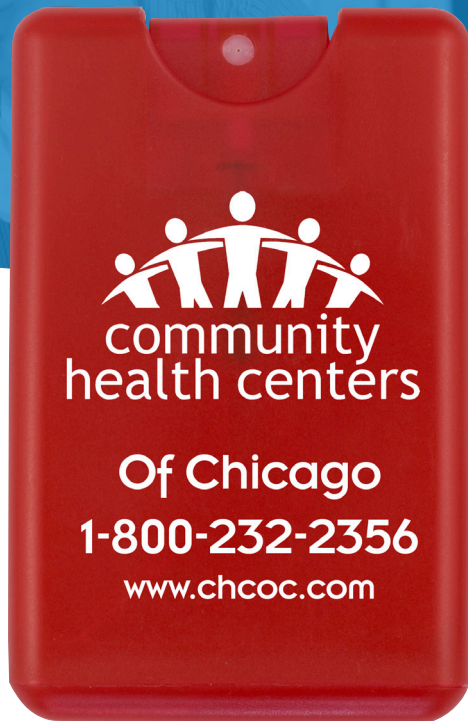
#5247 Shown with Silkscreen Imprint