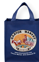
Shown with Optional Photolmage ® Full Color Imprint*

Setup Charge: 55.00 (G) per color, per location. Price Includes: One color imprint, one location. Additional Color/Location Imprint: add .50 (G) running charge. PMS Color Match: 40.00 (G) per color, not available for Full Color Imprint. *Photolmage ® Full Color Imprint Charge: add 1.10 running charge, plus 55.00 (G) Setup Charge. Price Includes: up to a Full Color Imprint. Add 3 Days to Production. Repeat Setup: 25.00 (G). Email Proof: 7.50 (G), add 2 days to production time. Production Time: 5 Days. Packaging: Bulk. Weight: 22 lbs. (100 pcs. Material: 80GSM Non-Woven Polypropylene.