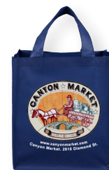
Shown with Optional Photolmage ® Full Color Imprint*

Setup Charge: 55.00 (G) per color, per location. Price Includes: One color imprint, one location. Additional Color/Location Imprint: add .50 (G) running charge. PMS Color Match: 40.00 (G) per color, not available for Full Color Imprint. *Photolmage ® Full Color Imprint Charge: add 1.10 running charge, plus 55.00 (G) Setup Charge. Price Includes: up to a Full Color Imprint. Add 3 Days to Production. Repeat Setup: 25.00 (G). Email Proof: 7.50 (G), add 2 days to production time. Production Time: 5 Days. Packaging: Bulk. Weight: 22 lbs. (100 pcs. Material: 80GSM Non-Woven Polypropylene.