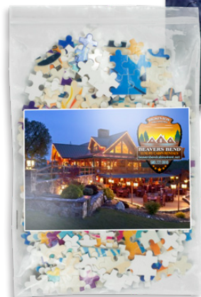
#PZ500 Shown Resealable Bag