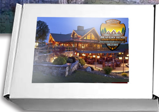
#PZL502 Shown Gift Box Included