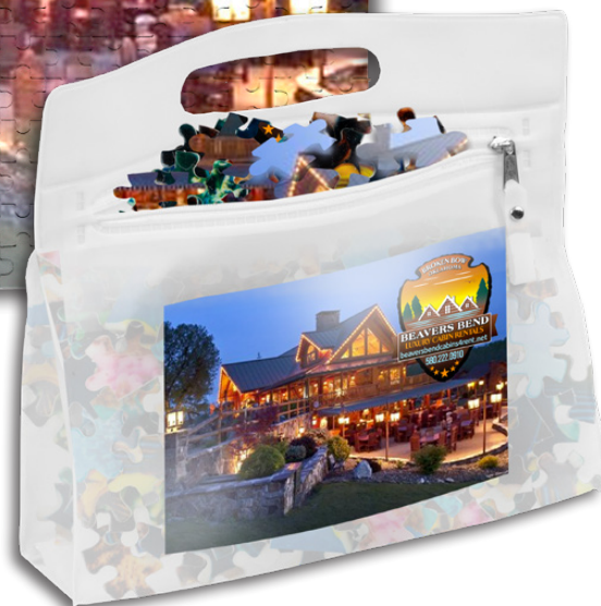
#PZ501 Shown Vinyl Pouch Included