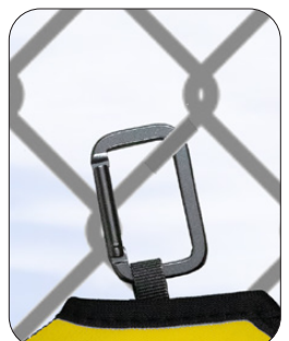
Carabiner Hanging Hook

Full Color Imprint Setup Charge : 60.00 (G) regardless of number of colors. Price Includes: Up to a full color digital imprint on the front of paddle cover (backside imprint is not possible. Repeat Setup Charge : 32.50 (G). Email Proof Charge : 7.50 (G), add 2 days to production time. Production Time : 5 days up to 250 pcs; 7 Days 251-1000 's pcs. Weight : 24 lbs. (100pcs.). Packaging : Bulk Packed. Material : 3MM neoprene and some polyester.