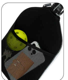
Backside Mesh Pocket