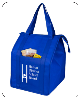
Shown Fully Zipped Up