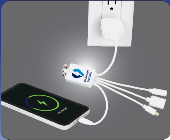
CONVENIENT WAY TO CHARGE YOUR DEVICES