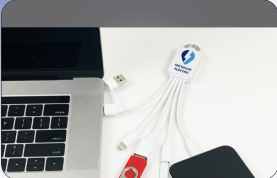
STANDARD USB AND TYPE C EXPANSION HUBS