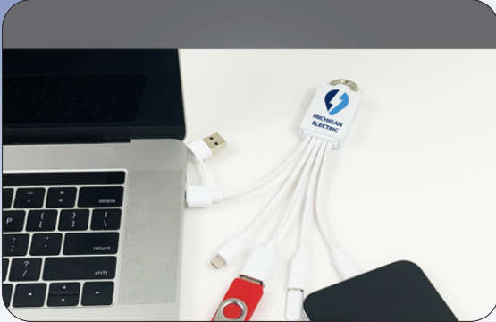
STANDARD USB AND TYPE C EXPANSION HUBS