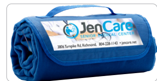
Shown with PhotoImage® Full Color Imprint* add 1.10 (G) running charge

Repeat Setup: 32.50 (G). Email Proof: 7.50 (G), add 2 days to production time. Production Time: 5 days up to 240 pcs or Less (241 pcs+ - 7 Days). Material: Blanket - 100% Polyester Fleece. Flap: 600D Polyester. Weight: 22 lbs. (25 pcs.). Packaging: Bulk.