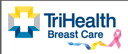
1. JPG art w/ white background box