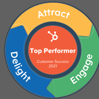
4. Result if all only outer white background box removed