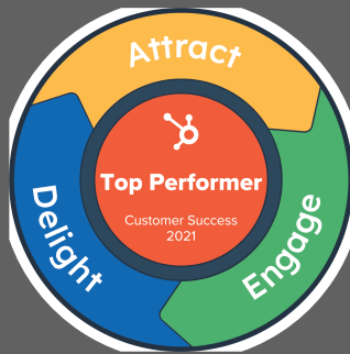
2. Result if printed as is (Unusual white areas)