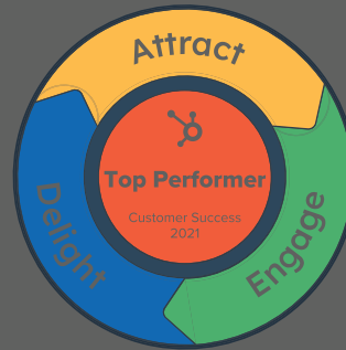
3. Result if all white removed (Interior white text is CLEAR)