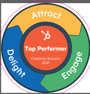
1. JPG art w/ white background & cut line