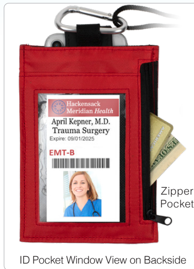
ID Pocket Window View on Backside