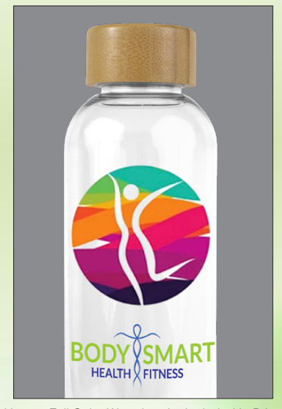
Up to a Full Color Wrap Imprint Included In Price