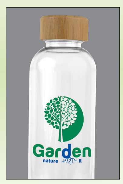
Multicolor Imprint Included In Price

Front & Back Imprint Area: 4" W x 6-1/4" H Optional Wrap Imprint: 8-1/2" W x 6-1/4" H