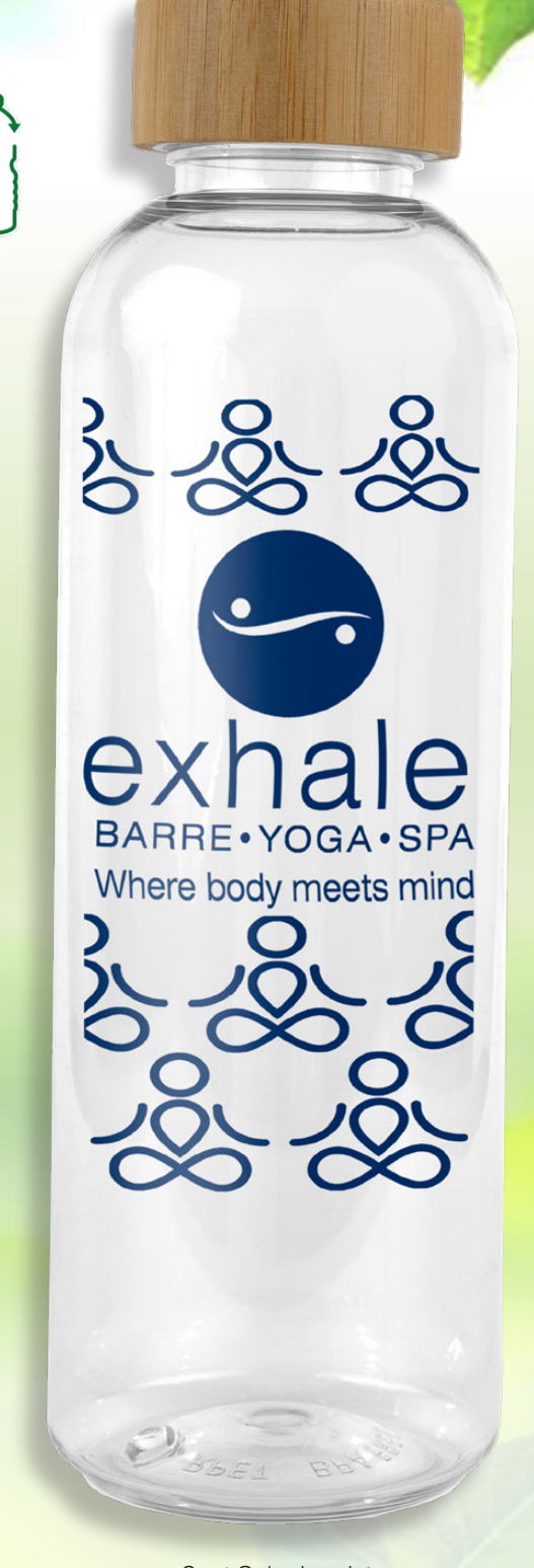
Spot Color Imprint

Setup Charge: 60.00 (G). Price includes: a one up to full color imprint (exact PMS matches are not possible) on the front, back or full wrap. If location(s) are not specified, factory prints on one side only. PMS Color Match: exact PMS matches are not possible. Email Proof: 7.50 (G), add 2 days to production time. Repeat Setup Charge: 32.50 (G), Repeat order ink colors will vary slightly from order to order. Production Time: 5 Days up to 500 Pcs, 7 Days for 501 to 2,500. Bottle Color: Clear Only. Material: 100% RPET with Bamboo and Plastic Cap. Weight: 8 lbs (25) pcs). Packaging: Bulk, fully assembled. BPA Free. Meets FDA requirements. Hand Wash; not for hot liquids. Bamboo shades may differ from piece to piece.