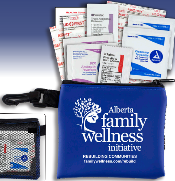
Mesh Fabric Backside

18 Piece Healthy Living Pack in Zipper Pouch