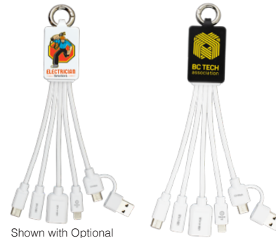
Shown with Optional Full Color Imprint*