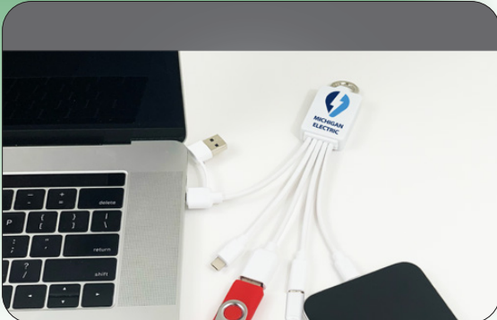
STANDARD USB AND TYPE C EXPANSION HUBS