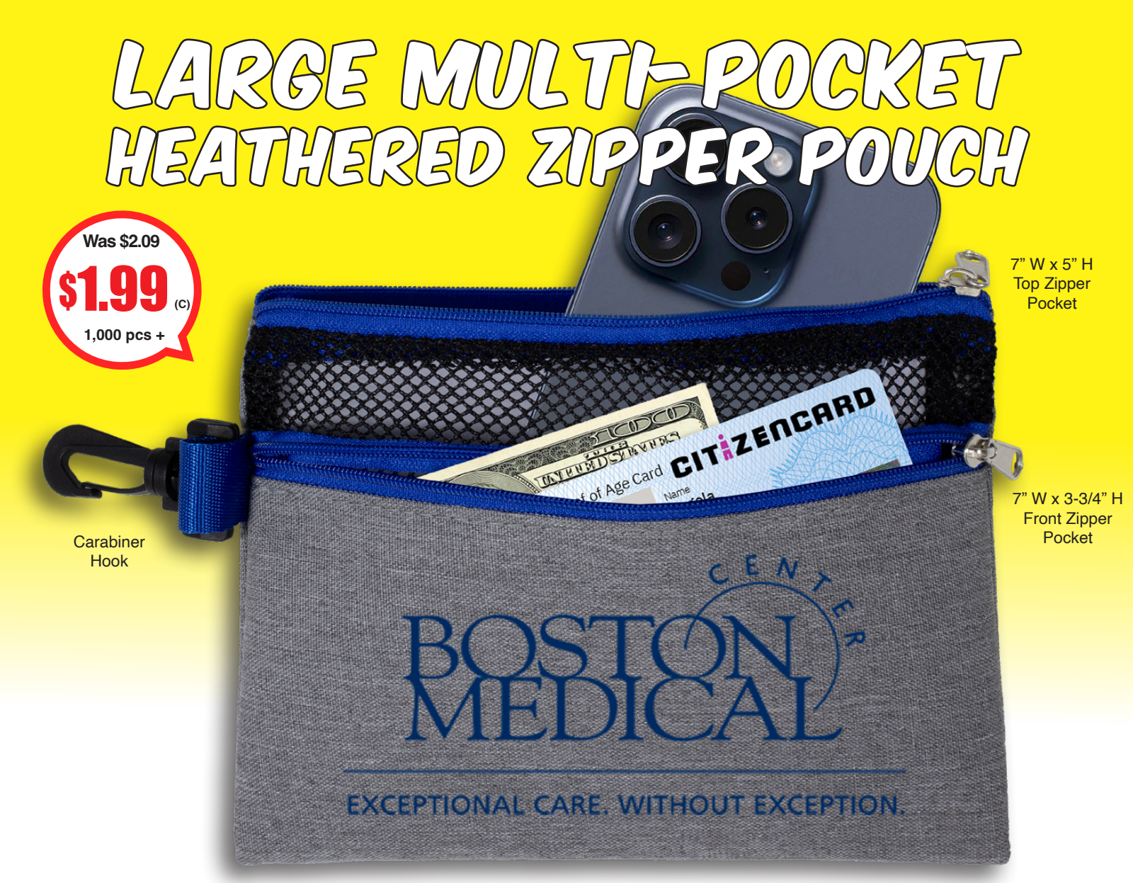
(Contents not included)