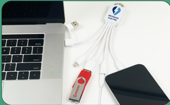
STANDARD USB AND TYPE C EXPANSION HUBS