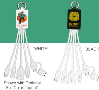
Shown with Optional Full Color Imprint*

Specify Promo #E5083 to receive special pricing at time of order placement as it cannot be applied later. This offer may not be combined with any other promotion, discount, coupon and/or special column pricing. Expires 8/31/2025.