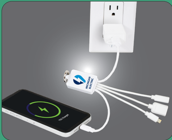
CONVENIENT WAY TO CHARGE YOUR DEVICES